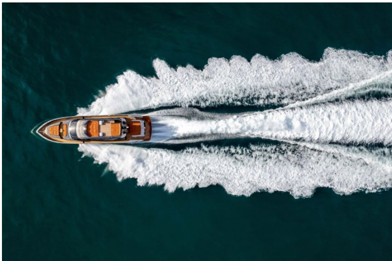
MAN engines, with their excellent power-to-weight ratio, contribute exactly to the DNA of AB Yachts and Maiora. Pictured is the AB80 with three MAN V12-2000s.